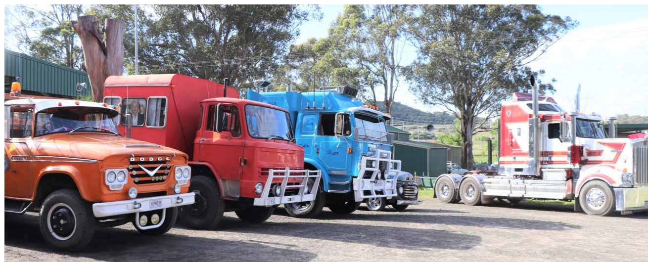
Historic and classic vehicle logbook and club runs Fact Sheet continued...