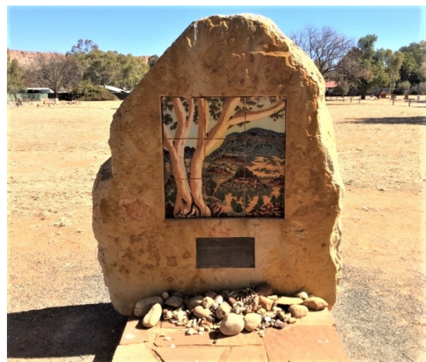
We spent a very enjoyable day at Henley on the Todd