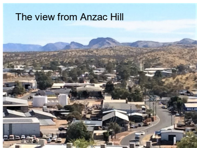
The view from Anzac Hill

The Road Transport Hall of Fame is very much up and running with a number of sponsors coming on board and visitor numbers attending the Museum are well up after the impact of Covid restrictions.