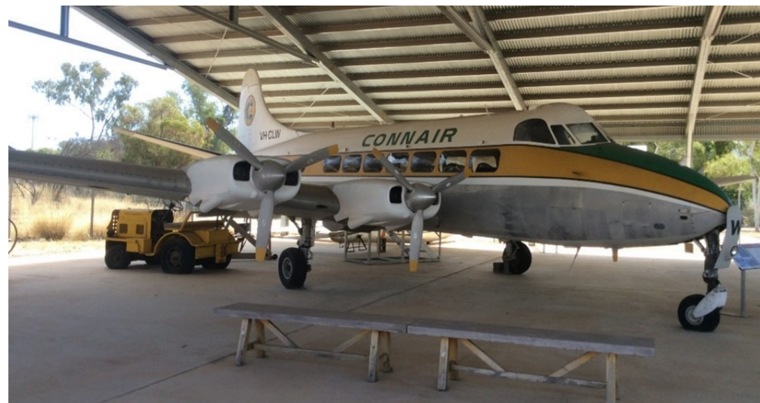
The Connellan Air Museum and Albert Namatjira's grave which is next to the Alice Springs Cemetery