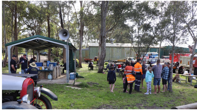
Breakfast at Menangle continued...