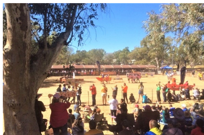
This event had not been held for three years because of Covid Lockdowns and was very well attended.